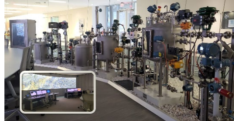
Figure 1. IAMC Equipment

IAMC equipment consists of complex electromechanical products that measure a variety of parameters such as temperature, humidity, pressure, corrosion and density as well as process control products such as valves, actuators, flow measurement devices and regulators, per the following and Figure 1 (Right):