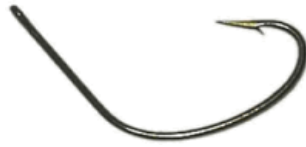
Figure 5 Kahle Hook

Malchoff et al. (2002) noted that New York anglers use a “sproat” hook for striped bass, which appears to be a local name for a “J” hook (M. Malchoff, personal communication). This differs from the sproat hook described by Eagle Claw as “.... a parabolic bend hook with a straight point. It is one of the best and strongest early designs for freshwater fishing and is very popular with bass fishermen for use with plastic baits (Figure 6).”