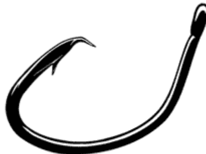
Figure 2 Circle hook, from http://www.ownerhooks.com