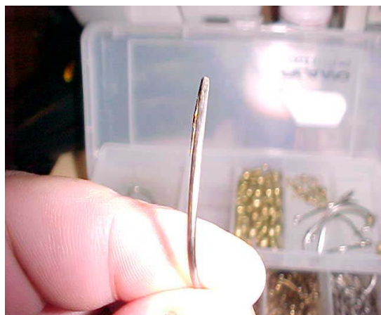
Figure 3 Hook with no offset angle